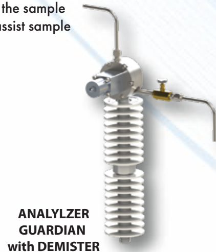
ANALYZER GUARDIAN with DEMISTER