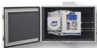
EXTREME WEATHER ENCLOSURE