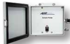
FIXED SAMPLE PUMP