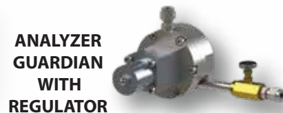
ANALYZER GUARDIAN WITH REGULATOR