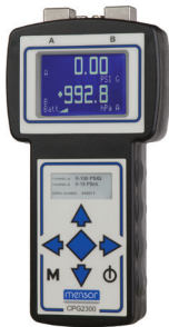
Portable digital pressure gauge, model CPG2300

The CPG2300 Portable Digital Pressure Gauge is used in diverse applications from rugged field calibration of pressure transmitters used in gas transmission, to testing and calibration of transducers in clean rooms and nuclear power plants. Wherever there is a need for a high level of accuracy in a handheld pressure calibration device.