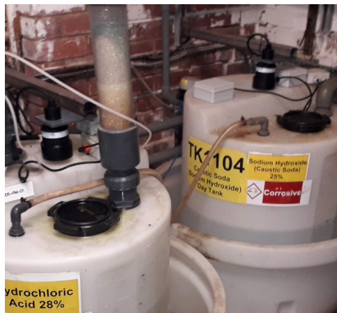
dBR8's reading through the plastic lid of a chemical tank.