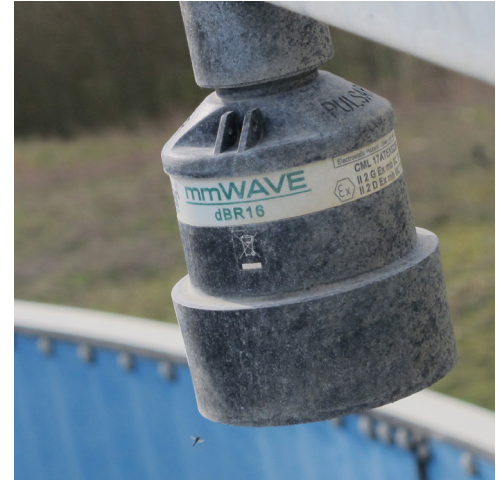
dBR16 on a foamy aeration tank.

Radar measurement will produce more stable results than ultrasonic sensors with limited acoustic power on foamy applications. This is because the foam interrupts the signal of the ultrasonic transducer; you can still get around this issue with ultrasonic measurement by using a sensor with high acoustic power. However, one thing that both technologies have in common is that it is virtually impossible for them to see through the foam to the liquid surface.