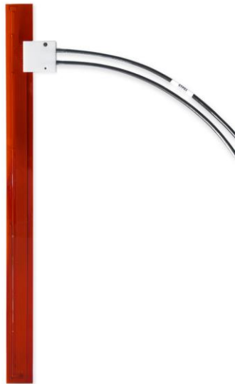
Figure 1 STP01 soil temperature profile sensor is applied in many large scale networks.

STP01 accurately measures the temperature profile of the soil at 5 depths close to its surface. It is used for scientific grade surface energy balance measurements. The sensor is buried and usually cannot be taken to the laboratory for calibration. The on-line self-test using the incorporated heating wire offers a solution to verify STP01's measurement stability.