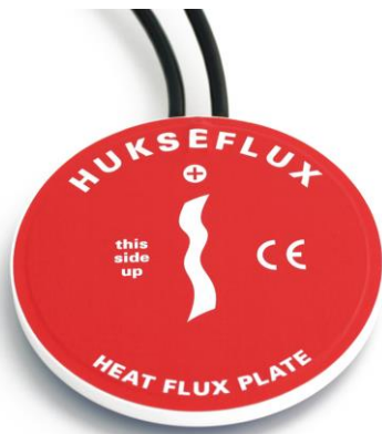
Figure 4 STP01 is often used in combination with HFP01SC self-calibrating heat flux sensor, shown in the picture