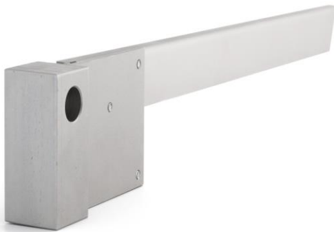
Figure 3 IT01 insertion tool is hammered down into the soil. After retracting it leaves a slit in which STP01 may be inserted

For ease of installation with a minimum of disturbance of the local soil, Hukseflux offers IT01 insertion tool.