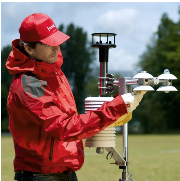
Figure 2 STP01 is often used in meteorological surface energy flux measurement stations