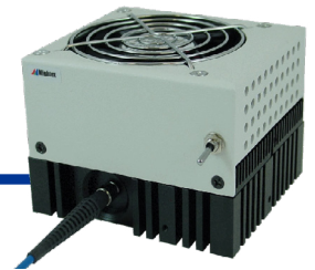
Typical Radiant Flux 1,2 (mW)