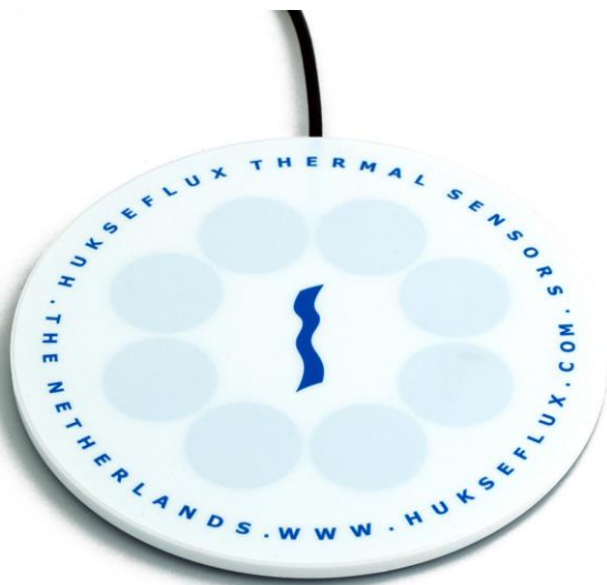
Figure 1 HFP03 ultra sensitive heat flux plate

HFP03 is an ultra sensitive sensor for measurement of small heat fluxes in the soil as well as through walls and building envelopes. The total thermal resistance is kept small by using a ceramics-plastic composite body. See also model HFP01 : putting several HFP01 sensors electrically in series is an alternative for using HFP03.