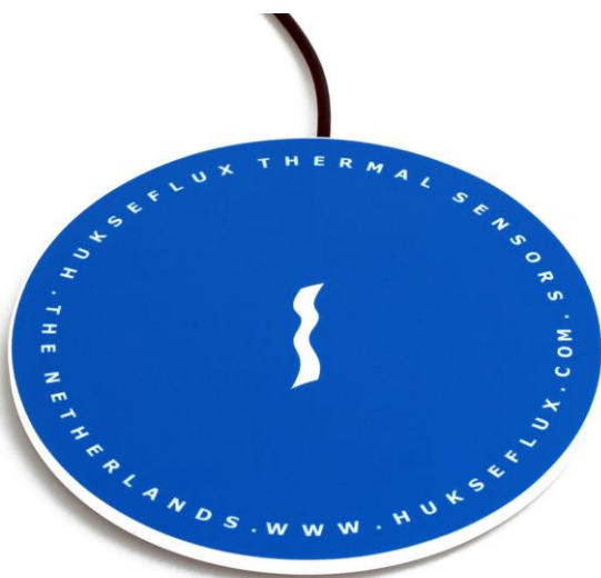
Figure 2 opposite side of HFP03, which has a blue coloured cover