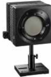
FL600A-LP2-65 / FL1100A-LP2-65