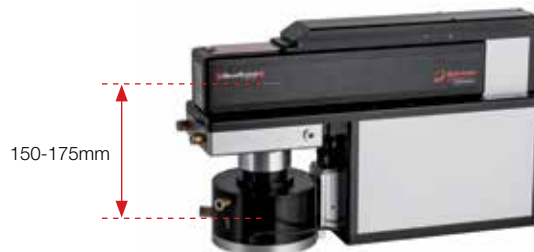
BeamWatch Integrated with 150-175mm distance between focus position and power meter