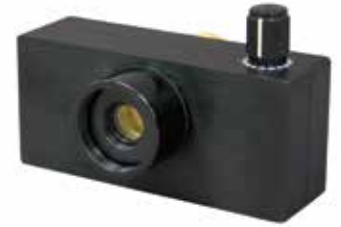
Figure 1 below shows the safe average power for negligible beam distortion from thermal lensing. Absorptive filters, such as used in the ATP-K have an upper power limit of approximately 100mW per mm beam diameter. For pulsed beams, Figure 2 shows the damage threshold for energy where breakage of the glass wedge may occur. This is approximately 5J per mm beam diameter. For lasers with power or energy levels above this the first stage of attenuation will need to come from our line of high power reflective attenuators.

The ATP-K is also designed to be used with the HP-series, high power attenuators and beam splitters. Both types of attenuators attach directly to the ATP-K via C-mount while a Beam profiler camera is attached from the opposite side. The ATP-K has simple reproducible attenuation settings, and has a wavelength range of 360 to 2500+ nm.