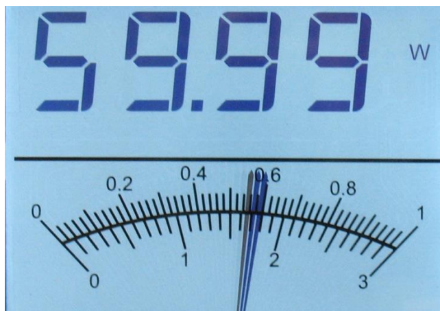
Fig. 1-4 Needle Display in Tail mode