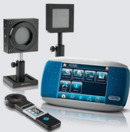
POWER & ENERGY METERS