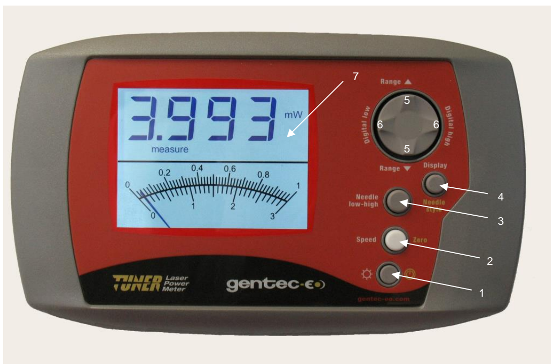
Fig. 1-1 TUNER Front Panel