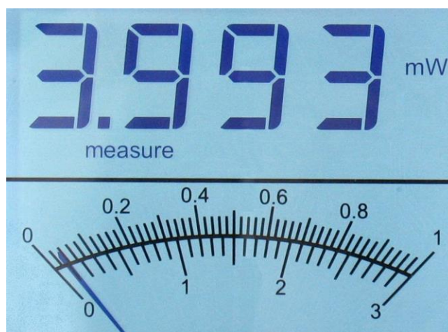
Fig. 1-3 TUNER LCD Display

The LCD provides measurement information, wavelength information, range information and other useful messages.