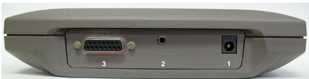
Fig. 1-2 TUNER Connectors