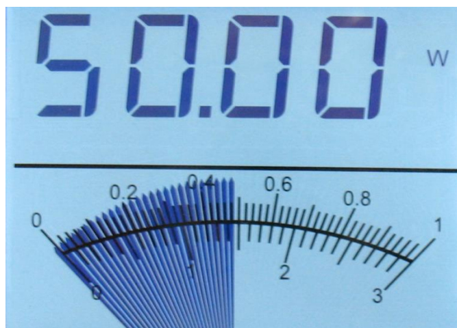
Fig. 1-5 Needle Display in Bar Graph mode

When the batteries are discharged enough to compromise the measurement, the TUNER displays "LO BATT" instead of the measurement. Refer to section 3 to replace the batteries.